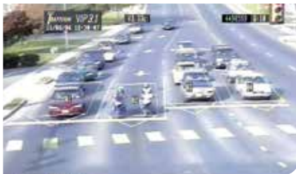
Vehicle presence detection at intersections